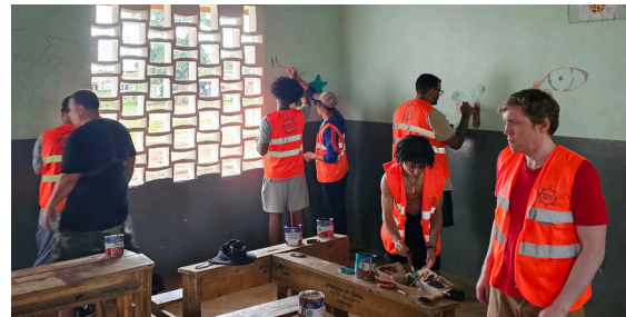
Bergen Charter High School: Opened a water well, painted school classrooms and distributed food to orphanages in Kenya