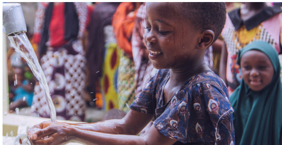
Fulton Science Academy: Opened 5 water wells in Tanzania