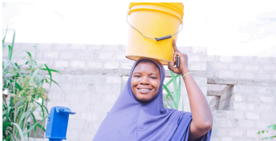
East Pennsylvania Student Group: Opened a water well, restored two schools, distributed food packages, and helped Albino children in Tanzania