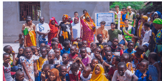
Sky Academy: Opened 2 water wells in Tanzania